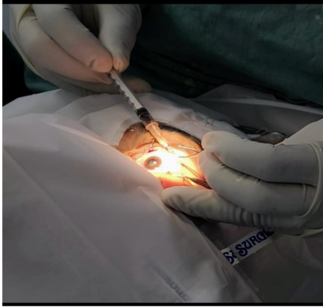
Image 1 . Showing injecting 0.2 mg Mitomycin C subconjunctivally.