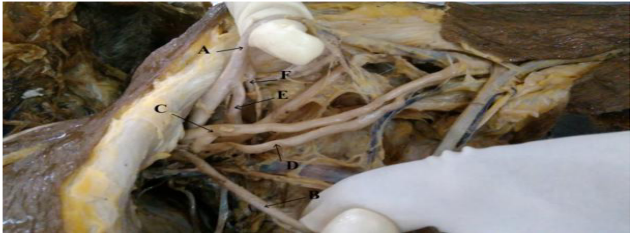
Figure 1. The left sided Axillary artery has been divided into posterior (A) and anterior divisions (B); the subscapular (E) and posterior circumflex humeral (F) arteries arose from the posterior division (A). The Median nerve (C), arising by two roots and the Ulnar nerve (D) have been labeled also.

The axillary artery divided into anterior and posterior branches at the lateral border of the pectoralis minor in the axilla in both the upper limbs of the female cadaver concerned. The anterior and posterior divisions were almost same in caliber. Median nerve was lying in between two divisions. The anterior branch continued distally to become the radial artery in the forearm. The anterior (very small) and the posterior circumflex humeral arteries and the subscapular artery arose from the posterior branch. This branch ran distally in the arm, gave origin to the arteria profunda brachii and ran further distally to become the ulnar artery in forearm.