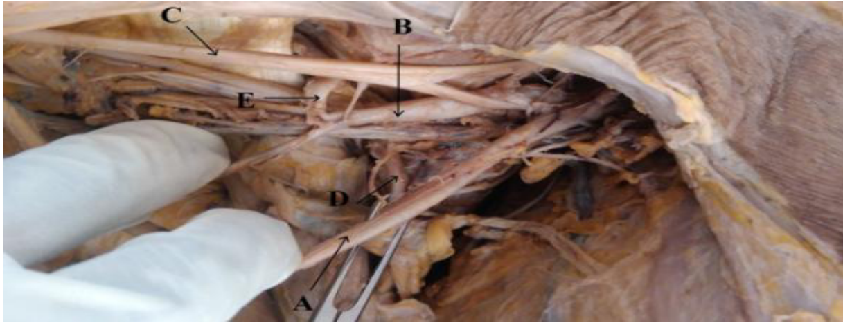
Figure – 4. The right sided Axillary artery has been divided into anterior (A) and posterior divisions (B); the subscapular (D) artery and the posterior circumflex humeral (E) artery arose from the posterior division (B). ‘D’ ran on the posterior wall of the axilla and ‘E’ went to enter the quadrangular space. The two roots of the Median Nerve (C) , encircled ‘B’.