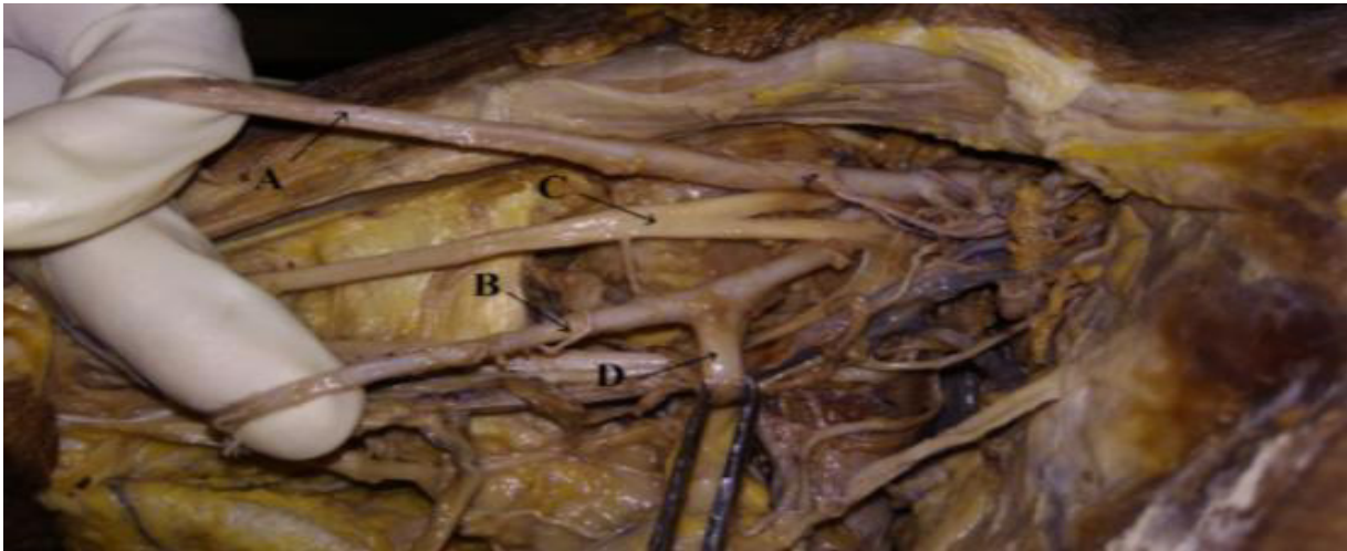
(C), accompanied by the ulnar nerve (F).