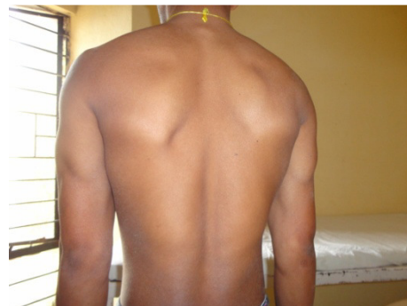
FIG 2A: Hypertrophy of Arm Muscles