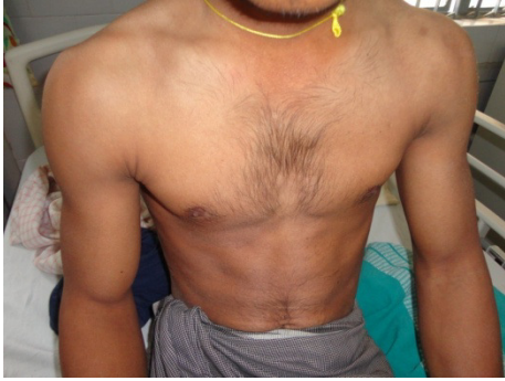
FIG 2B: Hypertrophy of Arm Muscles