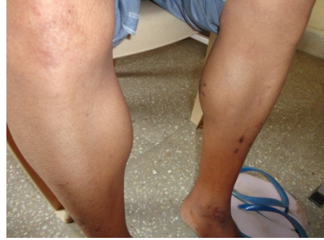
FIG 3A: Hypertrophy of Calf Muscles