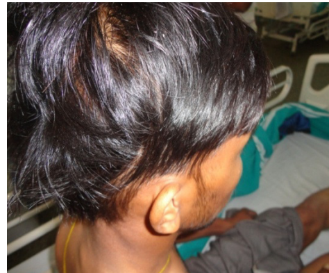
FIG 1: Coarse Hair with Alopecia

Literature review shows only few such cases reported in India, particularly in our region. This case report shows that Hoffmans syndrome though a rare case presentation of hypothyroidism has a good prognosis with timely diagnosis and appropriate management.