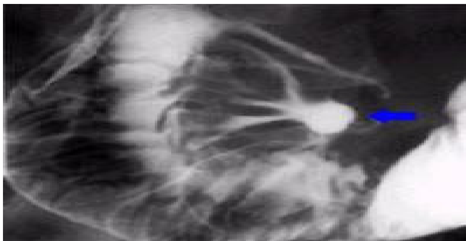
Figure 1-double contrast upper gastrointestinal series of anterior wall duodenal ulcer .