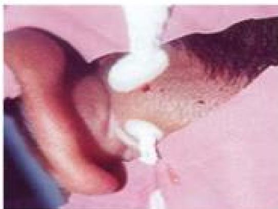
Figure 4: Intralesional cryotherapy