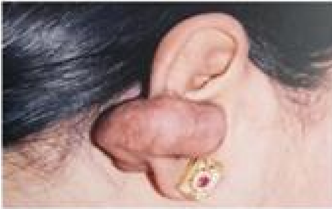
Figure 2a: A hard keloid over right ear