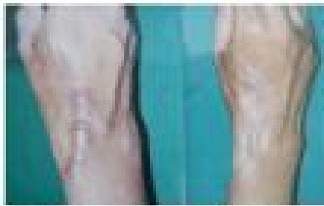
Figure 1: Hypopigmentation after intralesional triamcinolone

The first step in minimizing scarring should be attention to the early care of wounds. Following recommendations are based on general principles of wound healing (Table 2). The goal with minor wounds such as abrasions is to achieve rapid epithelization by moist healing with ointment or semioclusive dressings. When epithelization is delayed beyond 10-14 days the incidence of hypertrophic scarring goes up dramatically. [4] Surgical closure of an open wound should take into account the tension on the wound. Wounds subjected to tension due to motion, body location, or loss of tissue (after excision of a lesion) are at increased risk of scar hypertrophy and spreading. Appropriate splinting of the tissue with permanent intradermal sutures should be considered. A useful technique is a subcuticular closure with a polypropylene suture that can be left in place for six months. [5]