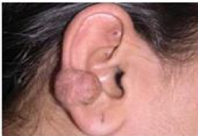
Figure 2a: After 4 intralesional injections of 5-FU and triamcinolone