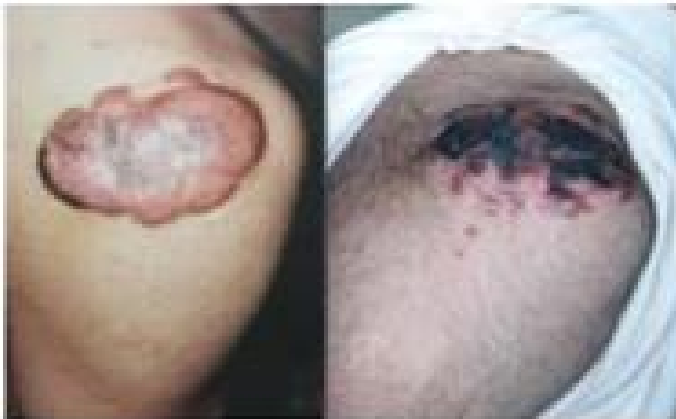
Figure 3: Marked flattening of keloid over shoulder with residual hyperpigmentation after intralesional 5-FU