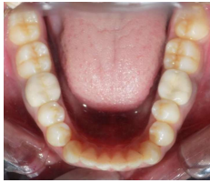
Fig.5- Final cementation with respect to 36,46

Slight enameloplasty was performed on mandibular anterior teeth to ensure a better substrate for adhesive bonding. Direct composite restorative procedure was carried out in the mandibular anterior region with respect to 31,32,33,41,42,43. The steps involved were acid etching using 35% phosphoric acid, rinsing for 30 s and drying with absorbent paper. A two-component adhesive system was applied on the dentin and the enamel and was light-cured. A combination of the incremental and stratified layering technique was used to restore the teeth using an aesthetic composite resin. The composite was added in increments of 1-1.5mm and was light-cured according to the manufacturer's instructions. The contouring was refined and the final polishing was performed with a high-luster polishing paste.(Fig 6)