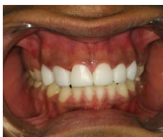
Fig.8- PMMA try in done

Before the technician glazed the restorations, they were tried in the mouth in a bisque bake stage to assess the final aesthetic appearance of the crowns. Any necessary modifications were done and if any changes required were conveyed to the technician. The crowns were received back from the technician with an untreated internal surface. This avoids the concern of decontaminating the etched internal surface of the crown after the crowns have been tried in. The fit was assessed and verified and the aesthetic appearance was approved by the patient. Etching of the internal porcelain surface (hydrofluoric acid) was carried out by the dentist in the dental surgery