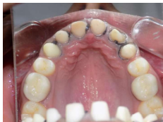
Fig.7- Tooth preparation done 11,12,13,21,22,23 to receive all ceramic crowns.

Maxillary anteriors (11,21,12,22,13,23) tooth preparation was done to receive all ceramic crowns. The general tooth preparation guidelines, 1.5-2 mm incisal reduction, 1.0-1.5 mm lingual reduction, 1.0-1.5 mm labial reduction with a deep chamfer finish line, an indiscernible equigingivalmargin and rounded line angles were followed. Gingival retraction was performed (Fig.7) and complete arch definitive impressions were made with vinyl polysiloxane. Shade selection was done and approval was taken from the patient regarding the desired shade. Provisionals were trimmed and polished and cemented with a non-eugenol-containing temporary cement. CAD-CAM technology was used for fabrication of the prosthesis. PMMA crowns try in was done. (Fig.8)