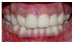
Fig.9-Final cementation all ceramic crowns 11,12,13,21,22,23

Final polishing of the margin is carried out with a rubber cup wheel and diamond polishing paste. (Fig.9)