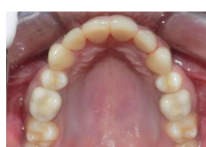
Fig.4- Final cementation with respect to 16,26