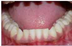
Fig.6 – Direct composite buildup done on mandibular anteriors 31,32,33,4,42,43.

Slight enameloplasty was performed on mandibular anterior teeth to ensure a better substrate for adhesive bonding. Direct composite restorative procedure was carried out in the mandibular anterior region with respect to 31,32,33,41,42,43. The steps involved were acid etching using 35% phosphoric acid, rinsing for 30 s and drying with absorbent paper. A two-component adhesive system was applied on the dentin and the enamel and was light-cured. A combination of the incremental and stratified layering technique was used to restore the teeth using an aesthetic composite resin. The composite was added in increments of 1-1.5mm and was light-cured according to the manufacturer's instructions. The contouring was refined and the final polishing was performed with a high-luster polishing paste.(Fig 6)