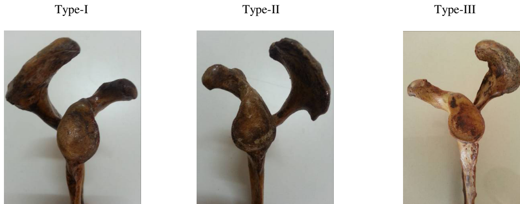
Fig.1. Photographs showing morphological types of acromion process of scapulae.