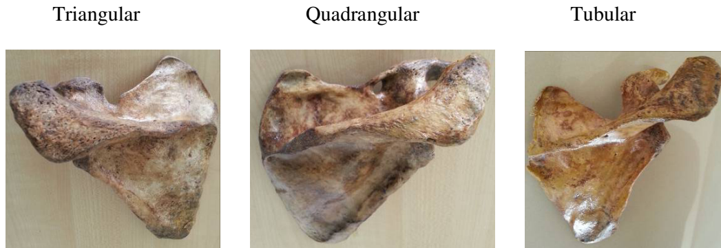
Fig. 3. Photographs showing various shapes of glenoid cavity of scapulae