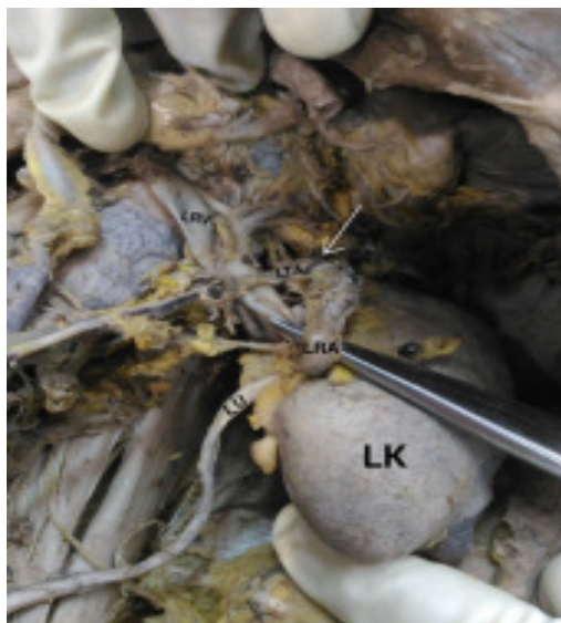
Fig.3 showing the origin of left testicular artery ( marked by arrow) fro left renal artery.