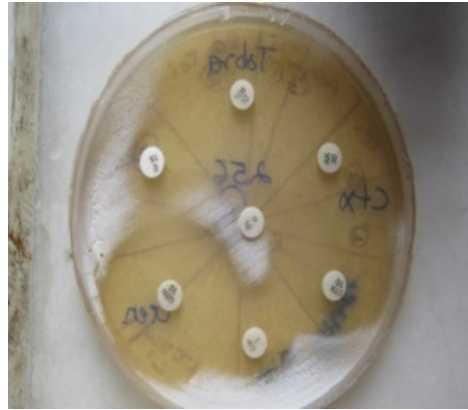
Figure 3 Antibiotic susceptibility test