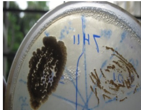
Figure 5. Opacity testing on Middlebrook 7H11 agar