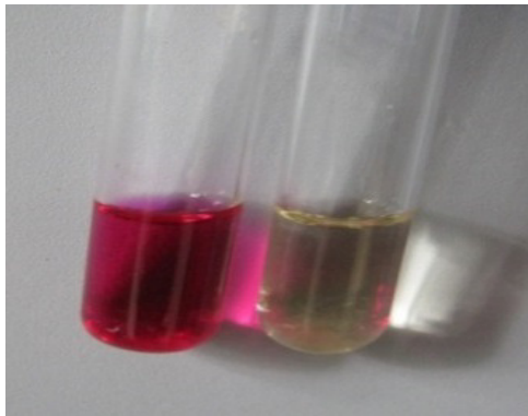
Figure 4. Arylsulfatase test