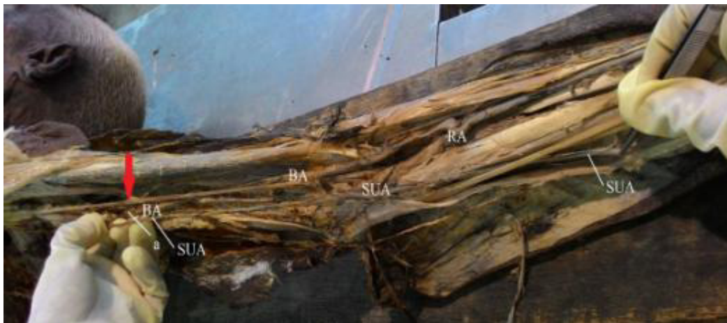
Figure 1: Origin & course of Superficial Ulnar Artery

In the middle third of the left arm, the BA was seen to give rise to a branch medially. This branch had a superficial course throughout its entire extent. It passed superficial to the muscles attached to the medial epicondyle of the humerus as well as the bicipital aponeurosis before entering the forearm and passing along its medial side. It was then seen to enter the palm, superficial to the flexor retinaculum, whereby it continued to form the SPA. This branch of the BA was hence identified as the superficial ulnar artery (SUA).