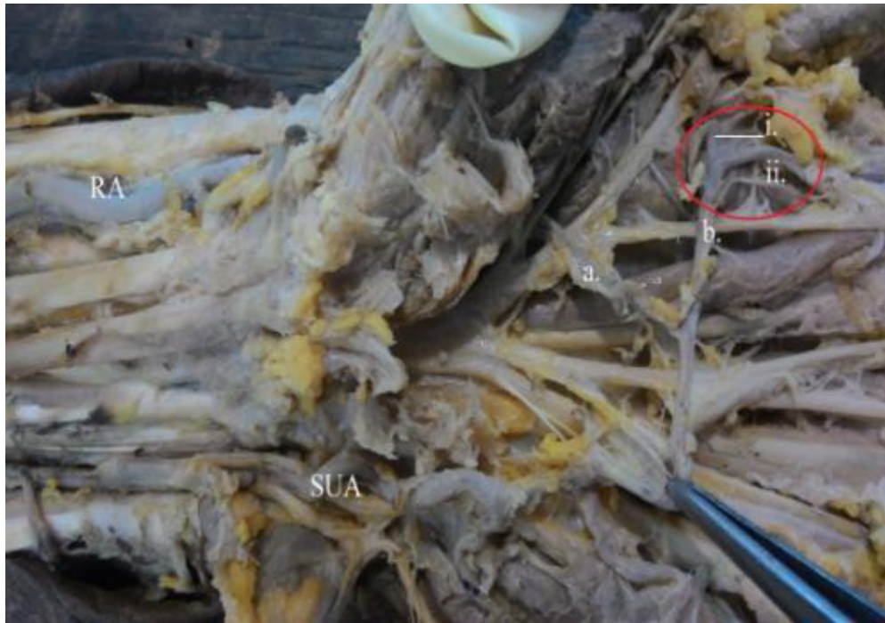
Figure 3: Anomalous branching of SPA

[RA – Radial Artery, SUA – Superficial Ulnar Artery, a – superficial terminal branch of RA, b – most lateral common palmar digital artery, i – arteria princeps pollicis, ii – arteria radialis indicis]