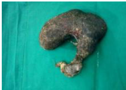
Figure 1: Showing Endoscopic view of trichobezoar