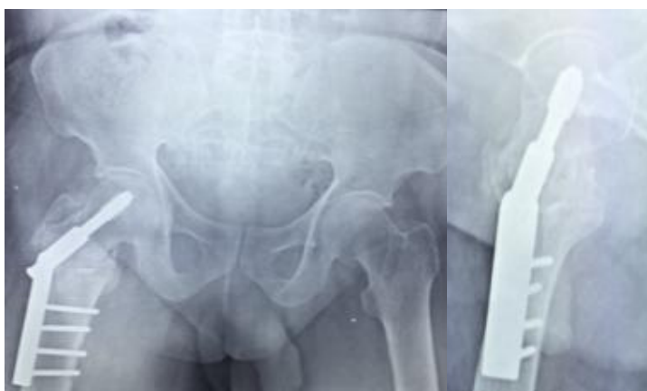
Figure 4 - Post operative xray after valgus osteotomy