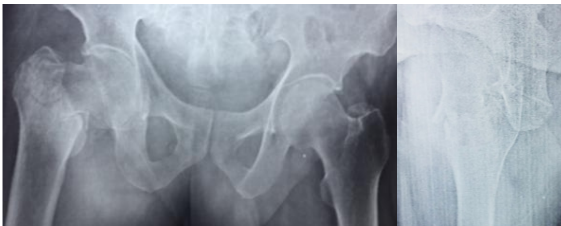
Figure 3 - Preoperative X-ray of varus malunited intertrochanteric fracture.