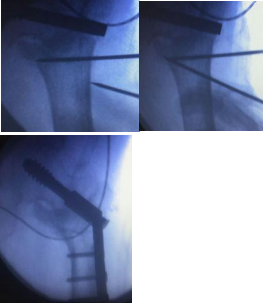
Figure 2 – Valgus osteotomy being performed

tract. From the drill hole on the lateral cortex multiple drill tracts were made both anteriorly and posteriorly to weaken the bone and for easier osteotomy using straight osteotome. A lateral based wedge of bone was removed and the osteotomy site closed by approximation of the proximal and distal segment of bone. This is achieved by abducting the limb on fracture table. The bone wedge resected was used as morcellised bone graft for the osteotomy site as well as intertrochanteric fracture site.