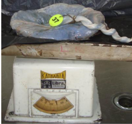
Figure 4: Measurement of weight of placenta

The maximum diameter was measured with help of thread and metallic scale in centimeter (figure 5).