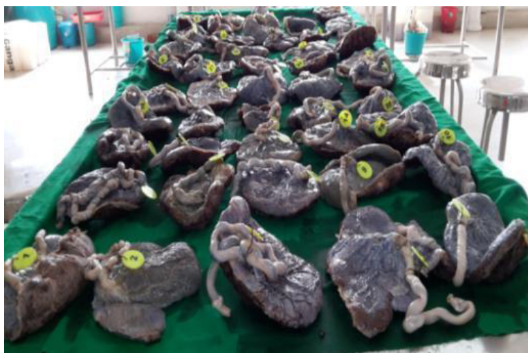
Figure 3: collection of placentae

cotton pad. The specimen was transported to the department of anatomy in formalin (10%) filled plastic containers. All the specimens were tagged with numbered disc for the purpose of identity (figure 3).