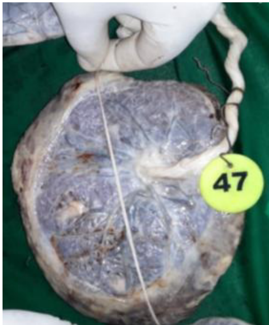
Figure 5: Measurement of diameter of placenta.