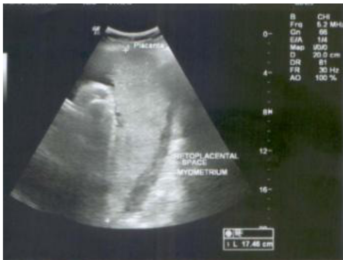
Figure 2: ultrasonographic film showing measurement of diameter of placenta

Placenta with a portion of umbilical cord, from the same subjects was collected in a clean tray after delivery. The membranes were cut off from their attachment to the placenta. Then it was gently expressed so as to remove its blood content and then washed thoroughly under tap water, mopped with dry