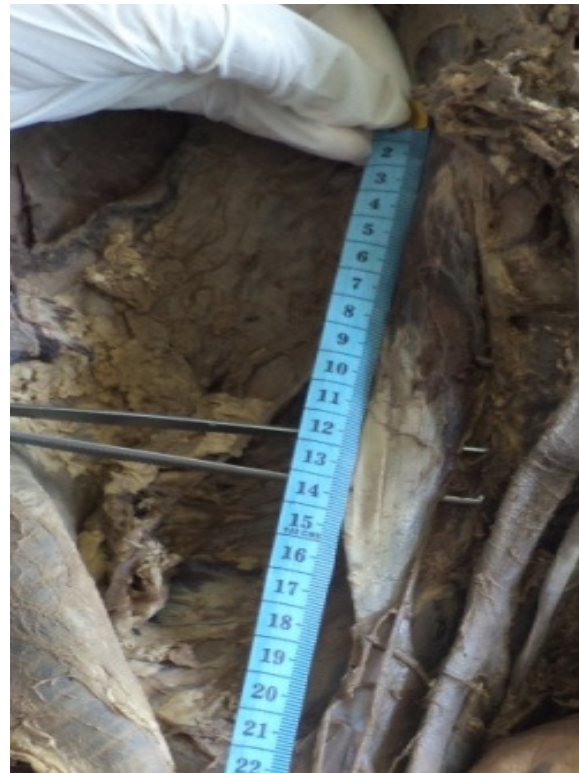
Figure 2: Measuring the total length of the muscle by using a tape measure.