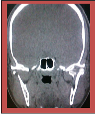
Fig. 5. Coronal CT of case 2 showing sagittal fracture of Lt condyle.