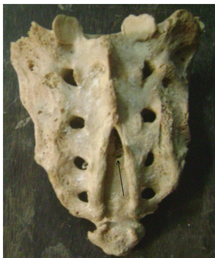
Figure –3; Inverted ‘V’ shaped, elongated sacral hiatus (marked with an arrow).