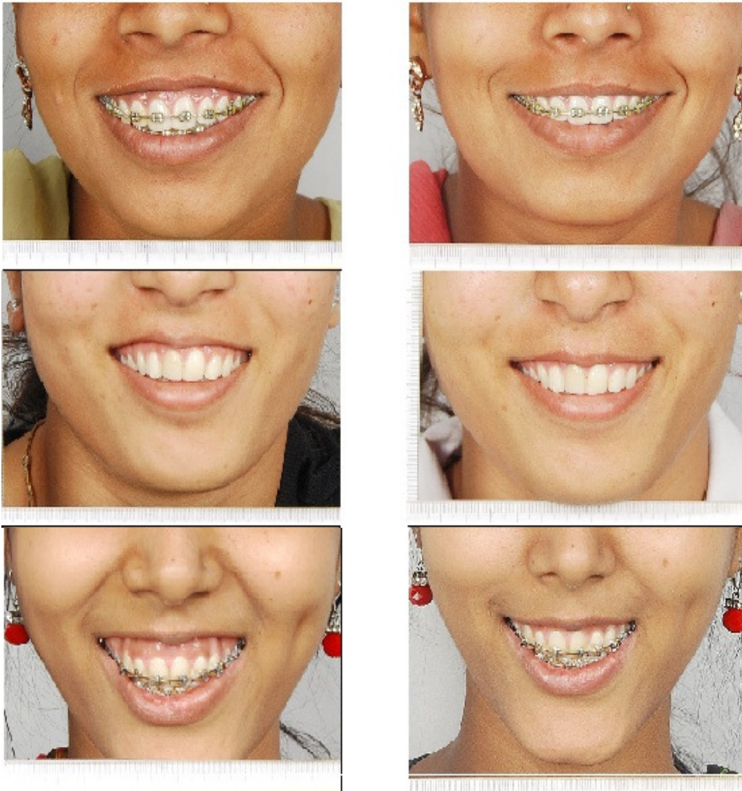
Fig-2 CLINICAL PHOTOGRAPHS BEFORE AND 14 DAYS AFTER BOTOX INJECTION

Indian Journal of Basic & Applied Medical Research